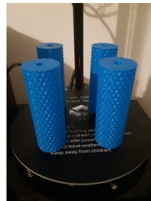
Image 2. Printed rollers on FDM 3D printer

Traditional manufacturing of system of rollers for making beeswax foundations requires usage of expensive machines such as CNC machine. This process requires a lot of precision and time to build, and the amount of waste after CNC milling can be high. 3D printing can do this process with much less time to build, nearly the same precision and without any waste. Image 2 shows rollers for making beeswax foundations printed on FDM 3D printer.